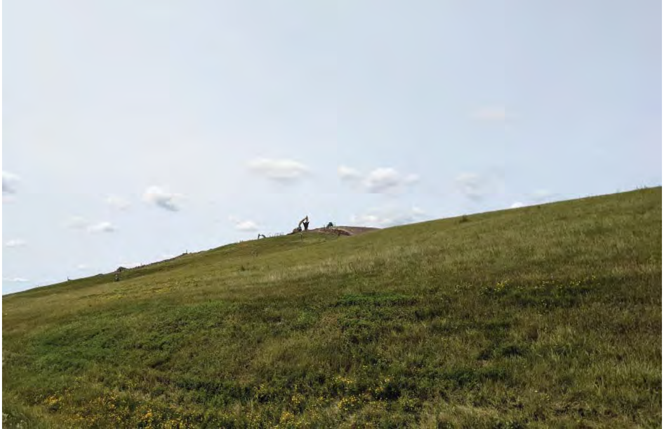
South slope of Phase 5 & 6, contractor at top of slope with excavator for connecting wells