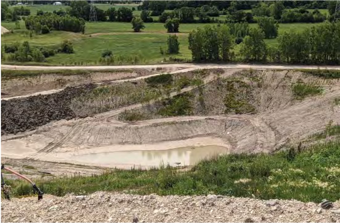
Temp Sed Basin, well pumped down