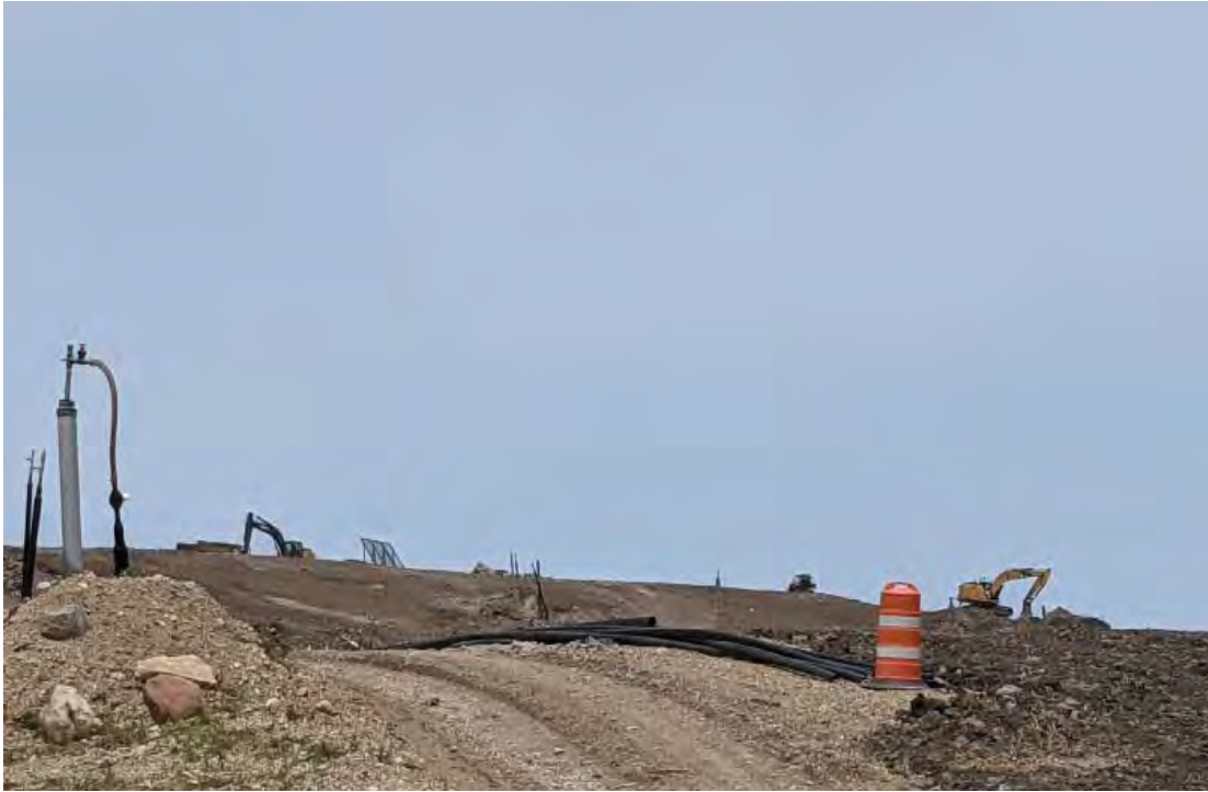
South slope of Emerald Park, top soil being spread