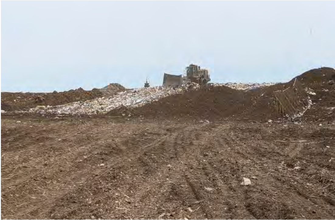
Working face in Southeast corner of Phase 6 at top of slope