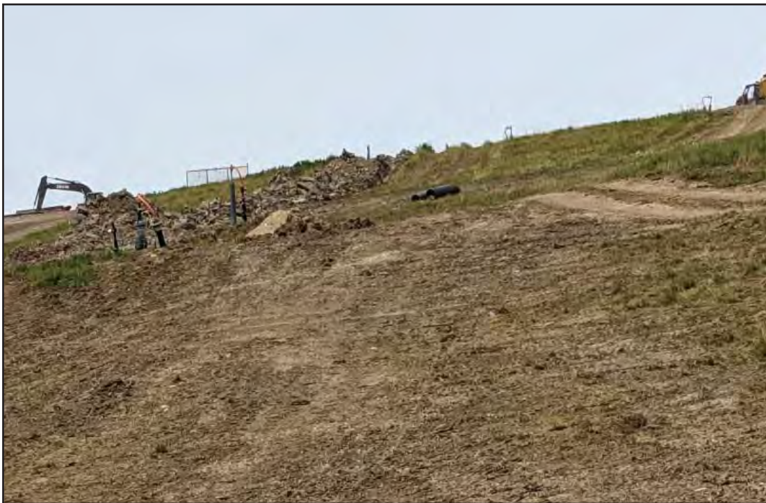
East slope of Phase 5, awaiting see