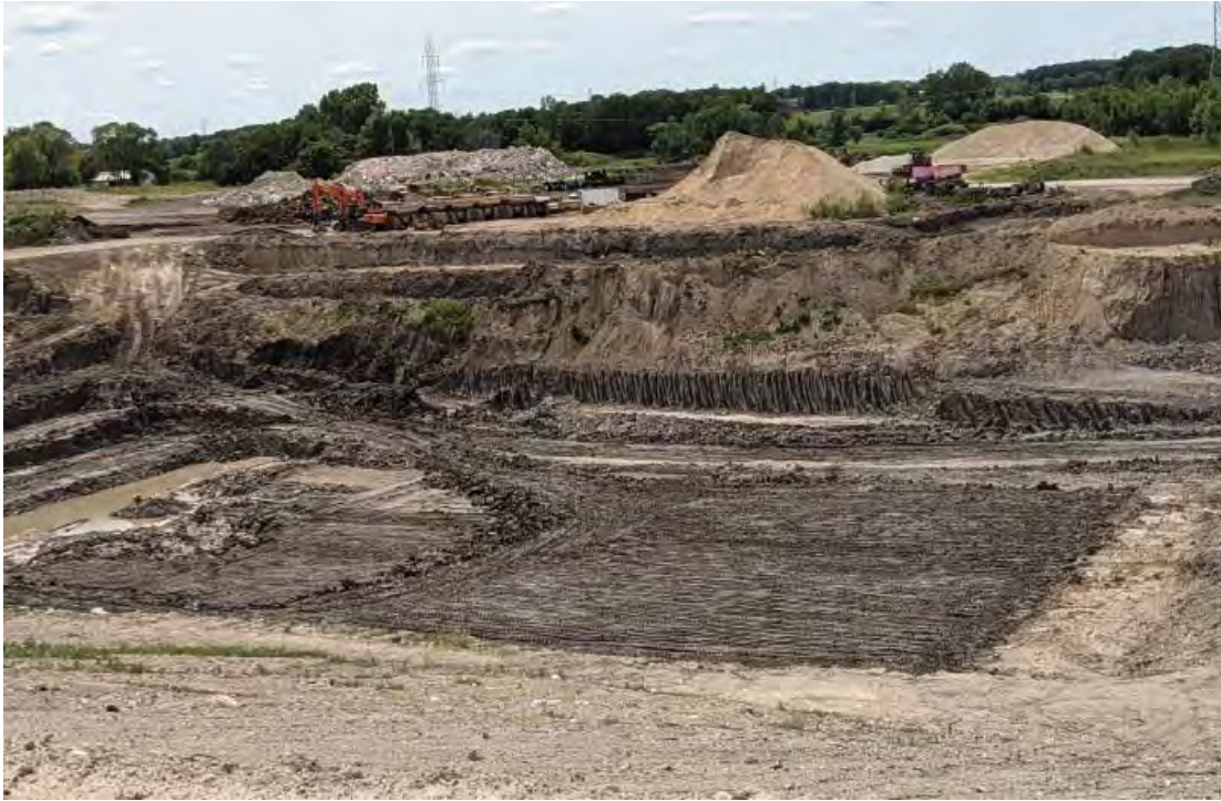
New cell construction, base nearly prepared for liner deployment