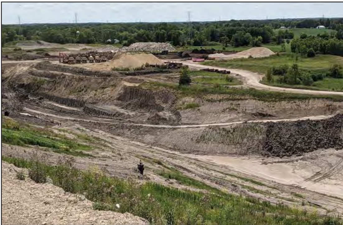
Temporary Sedimentation Basin transition