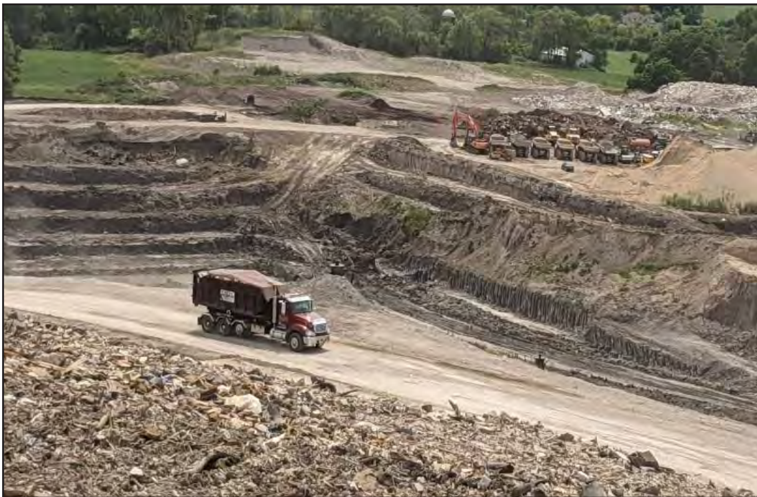
Overview of new cell