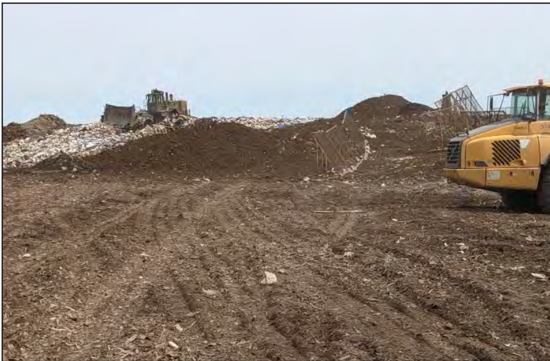
Working face in Southeast corner of Phase 6 at top of slope