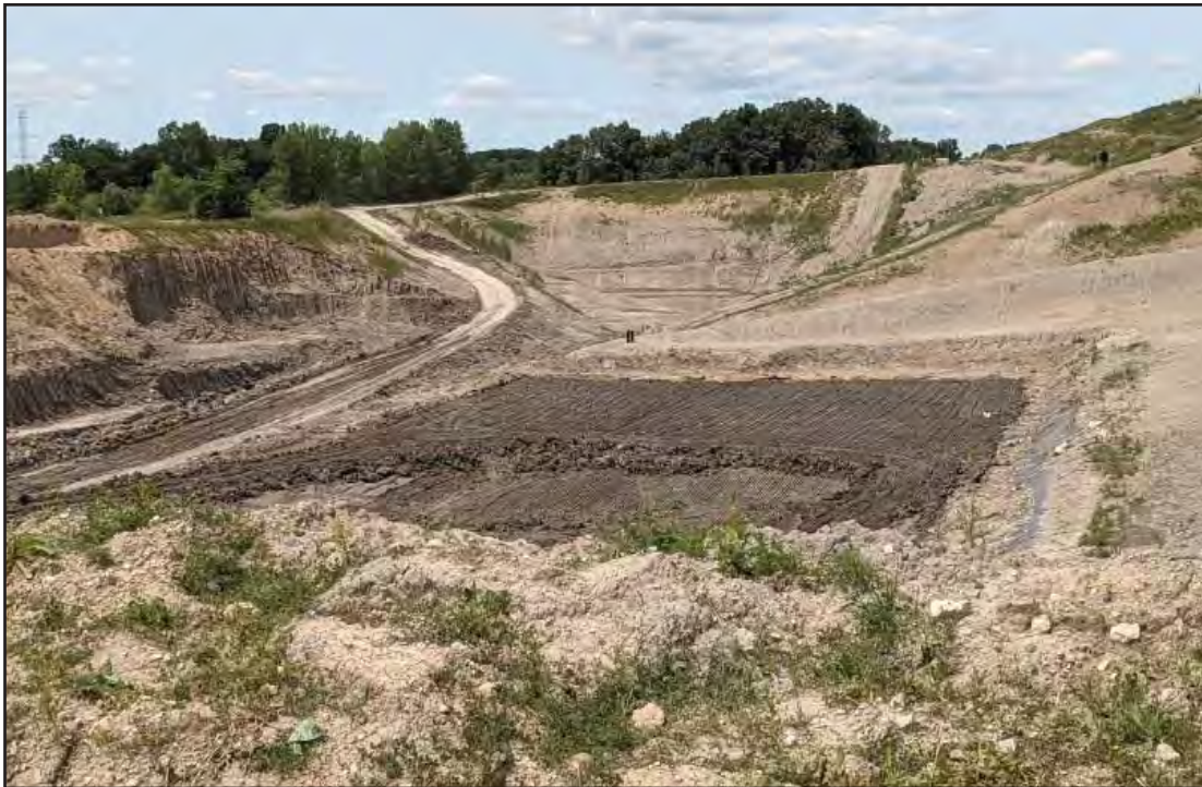
New cell construction, base nearly prepared for liner deployment