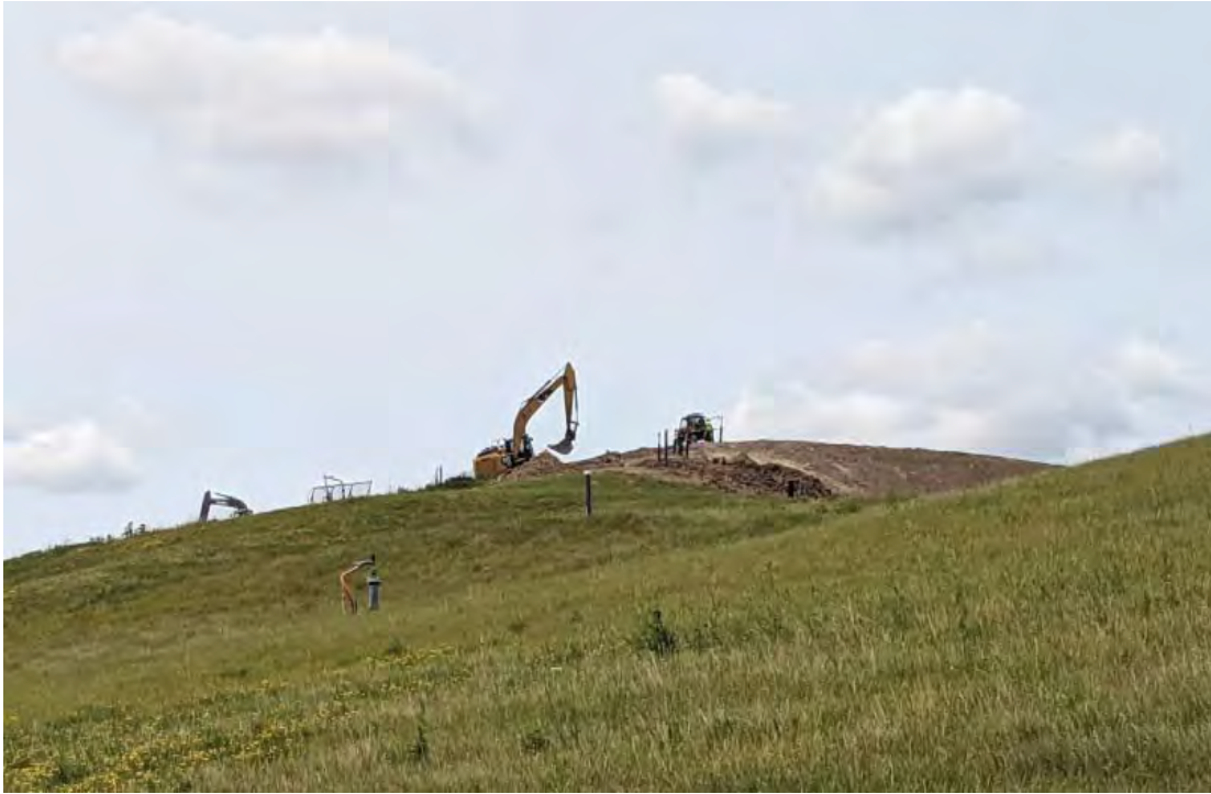
Contractor connecting new wells with HDPE piping