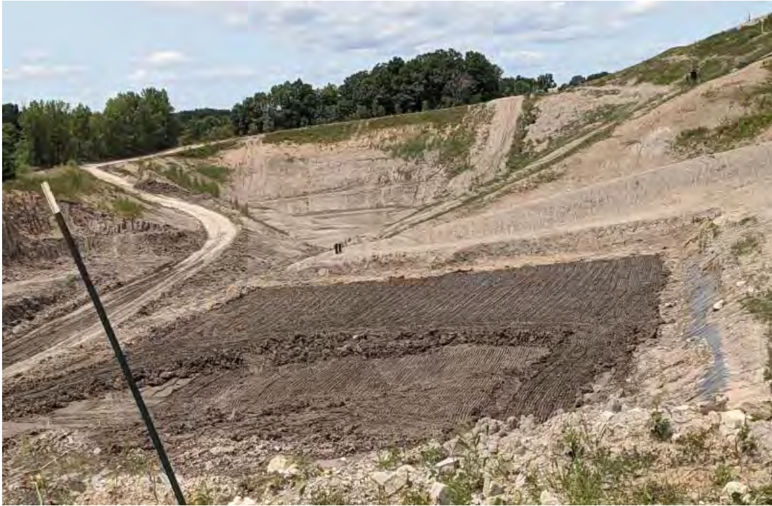
New cell construction, base nearly prepared for liner deployment