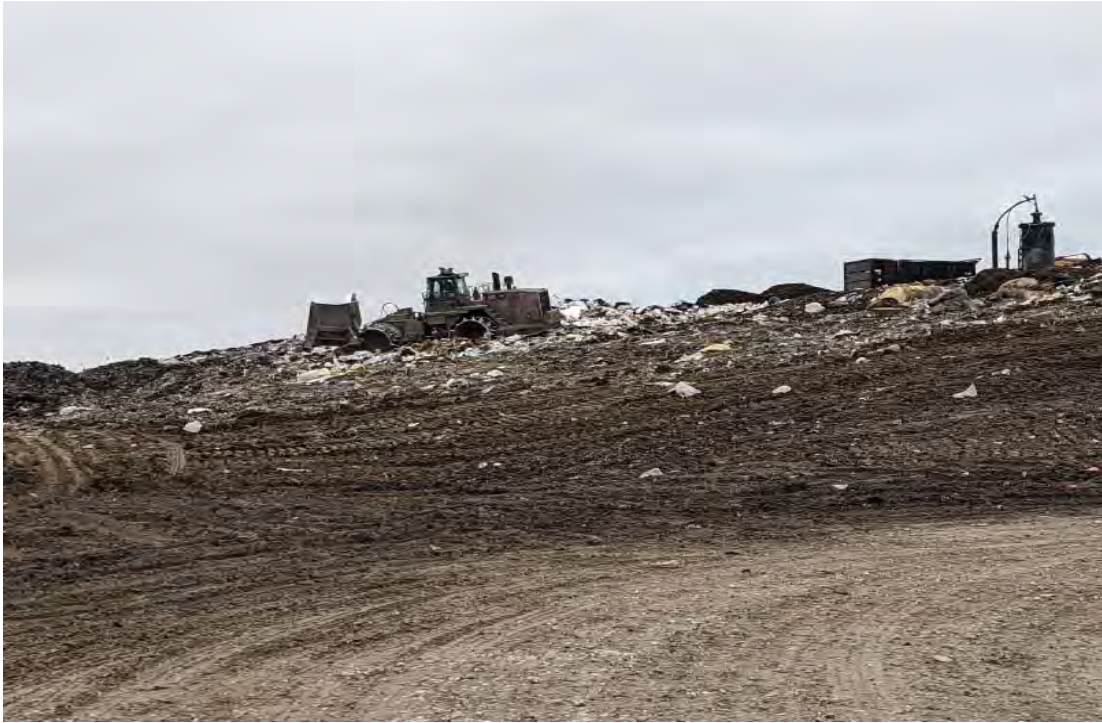
Working face in Northeast corner of Phase 7, over Phase 6