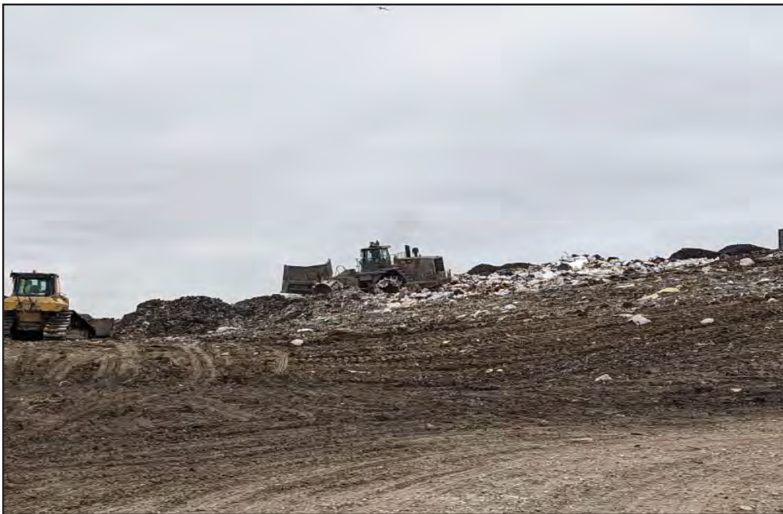
Working face finalizing lift in Phase 7