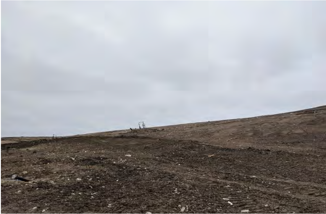
Slope erosion minimal