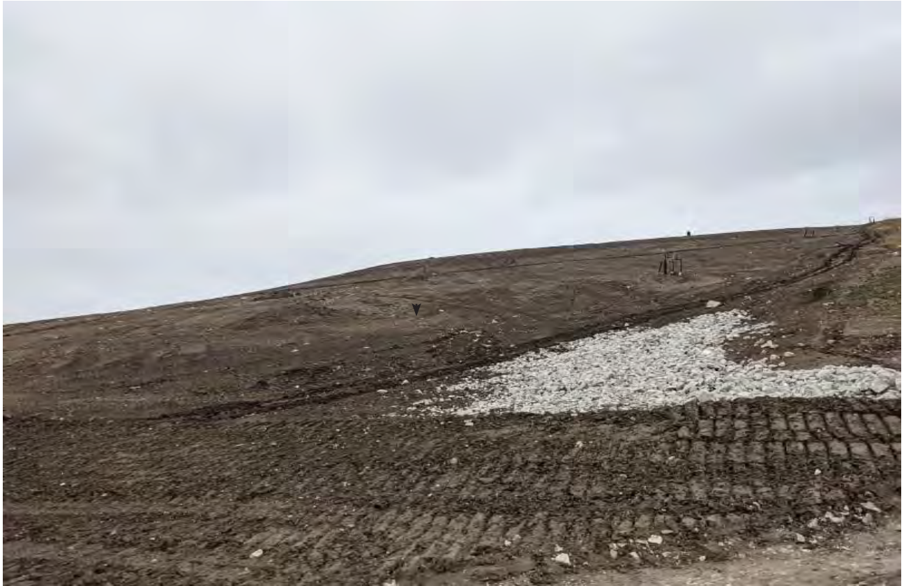
Phase 7 South slope restored with back dragging and new berm to prevent future erosion