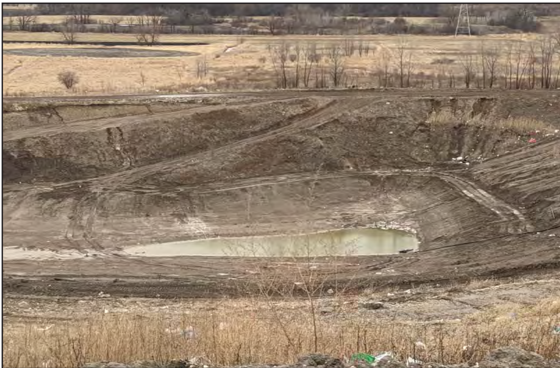
Temp sed basin well drained