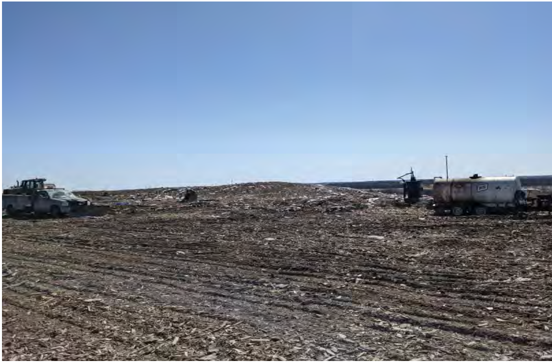
Upper plateau of Phase 7, well covered with autofluff