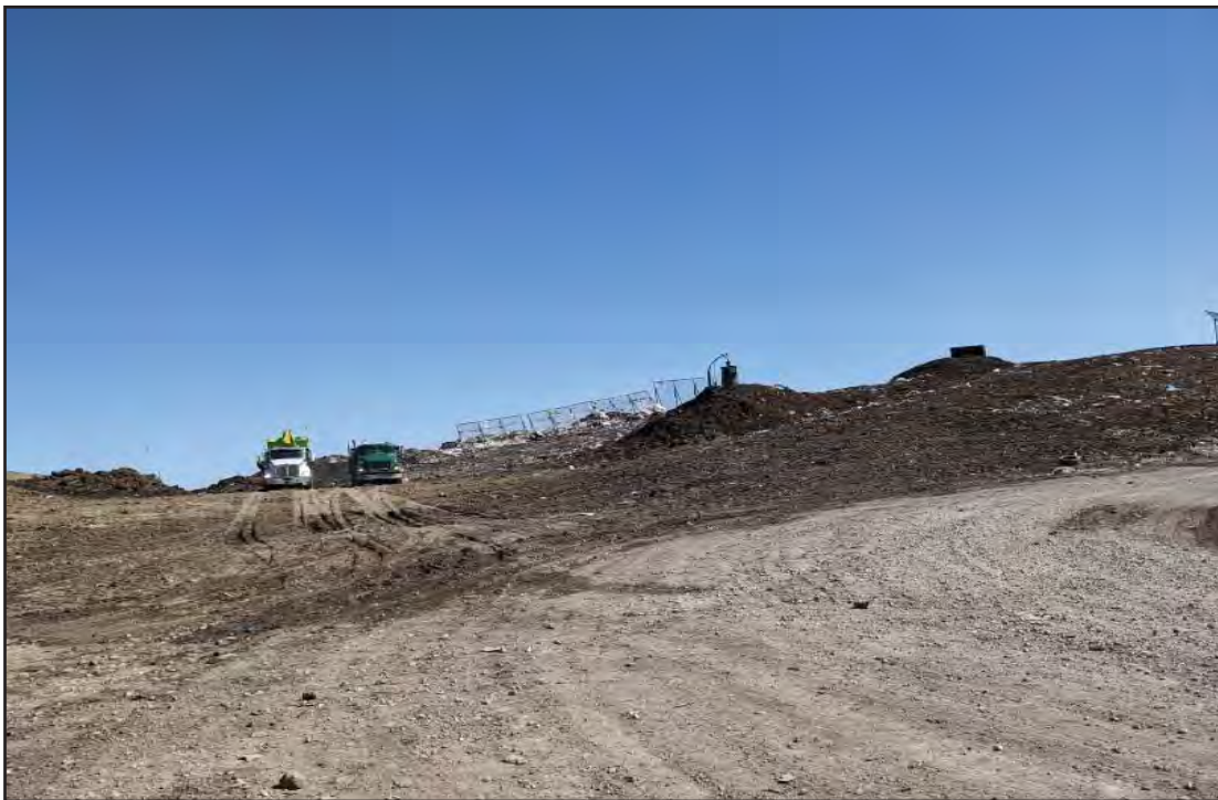
Truck cleaning out, North of working face