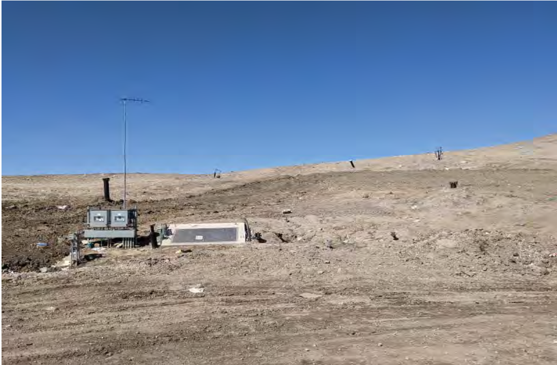
New berm on South slope of Phase 7 to protect slope from erosion