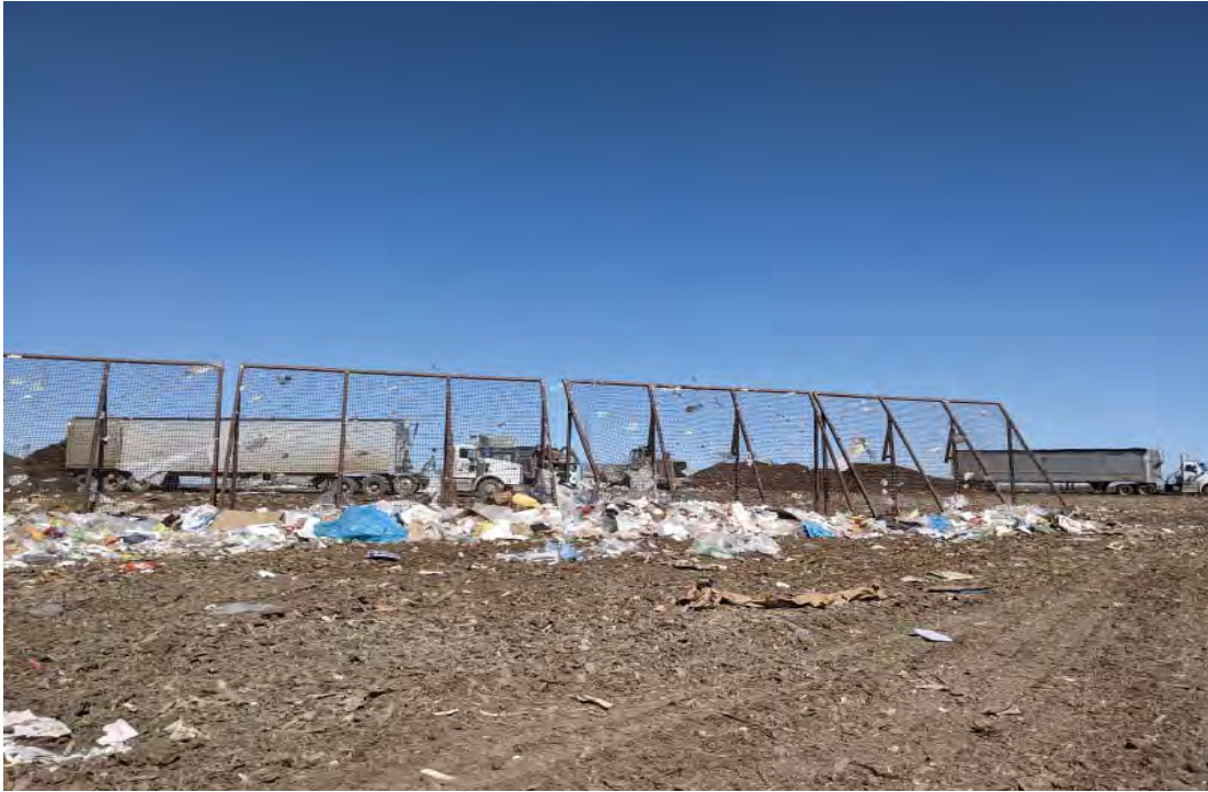
Litter trapped behind fences when gusts end