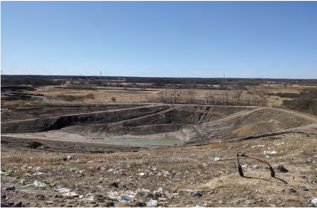
Temp sed basin pumped nearly dry