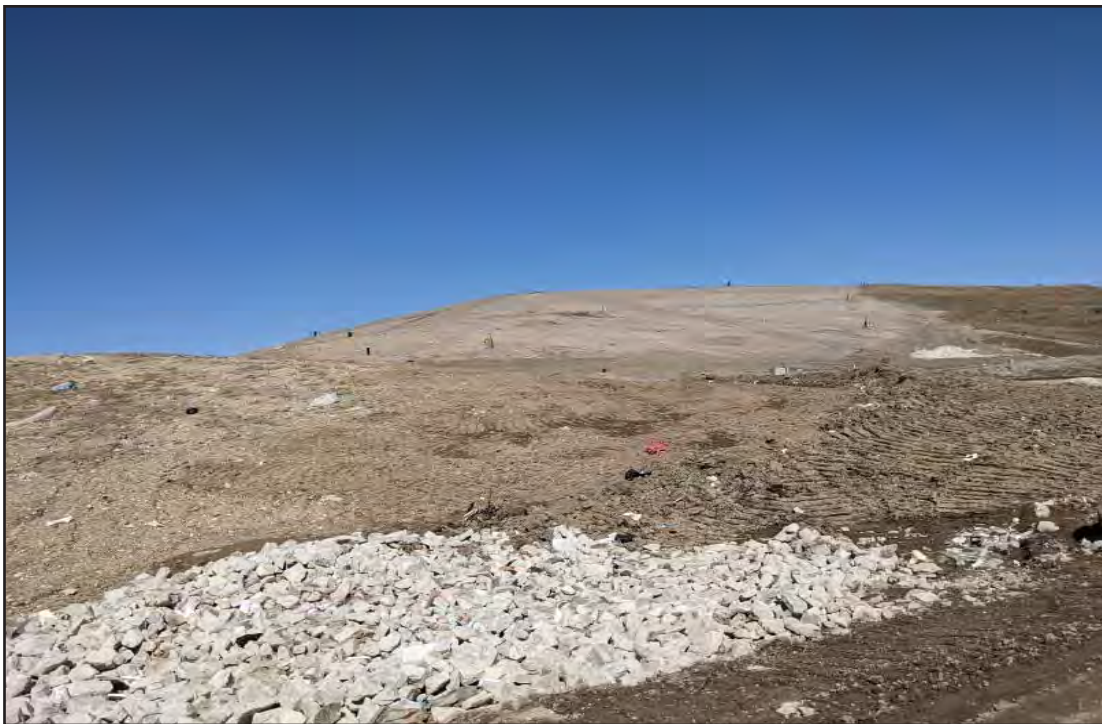
Armoring at base of berm developed to prevent erosion