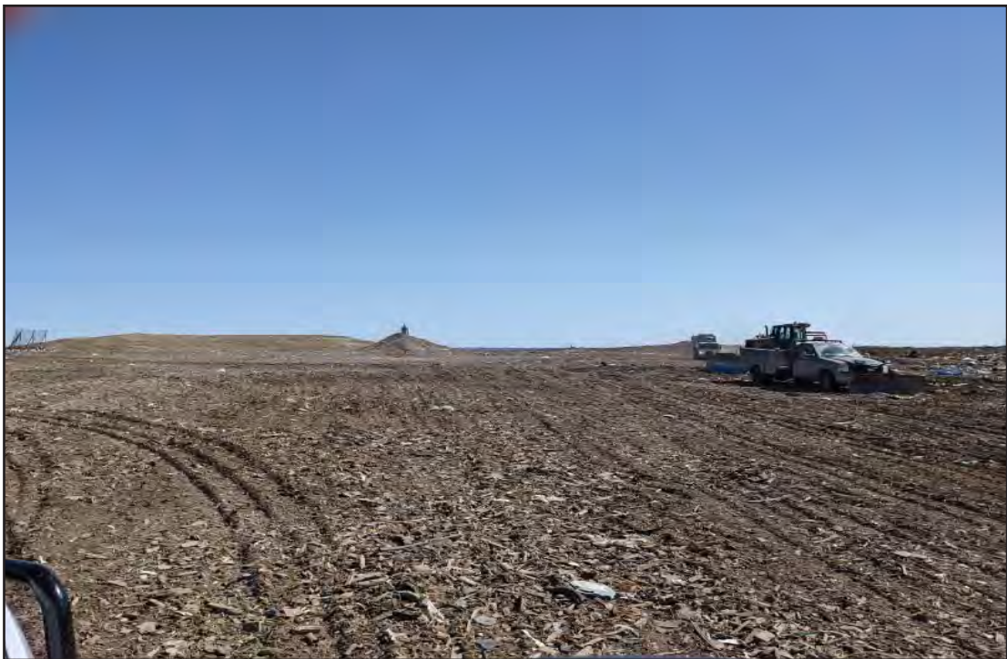
Upper plateau of Phase 7, well covered with autofluff