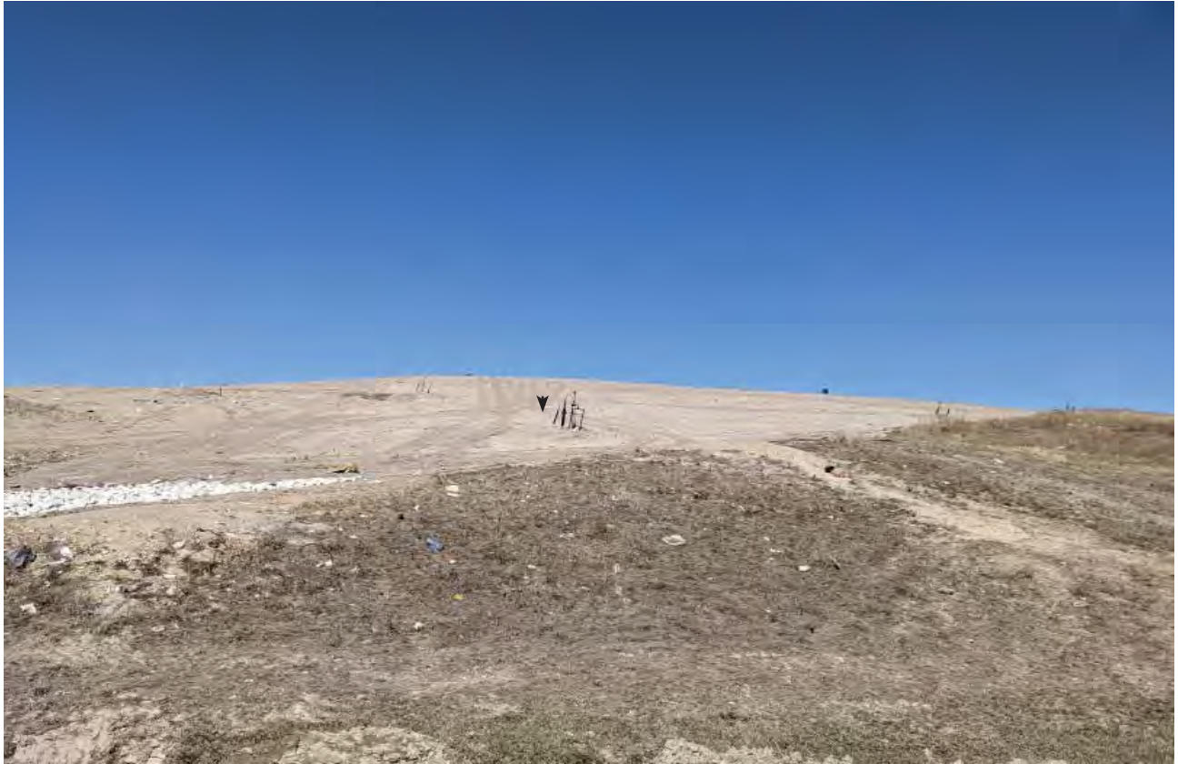
Phase 7 South slope restored with back dragging and new berm to prevent future erosion