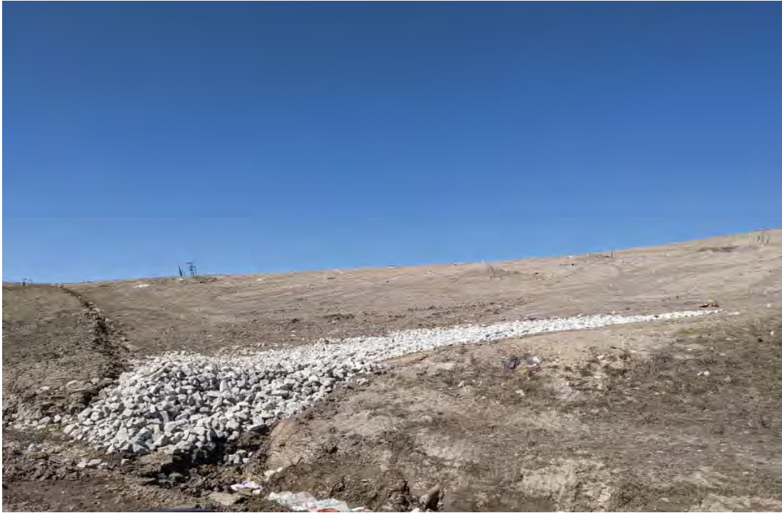
Armoring at base of berm developed to prevent erosion