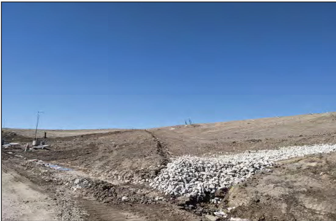
Armoring at base of berm developed to prevent erosion