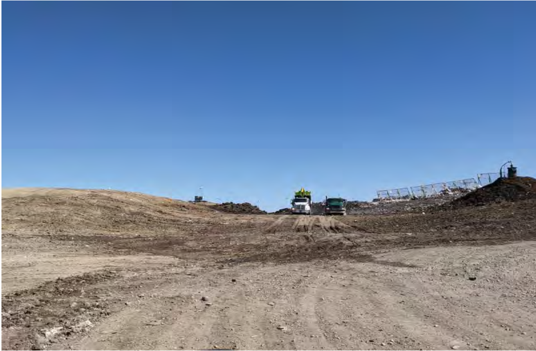
Truck cleaning out, North of working face