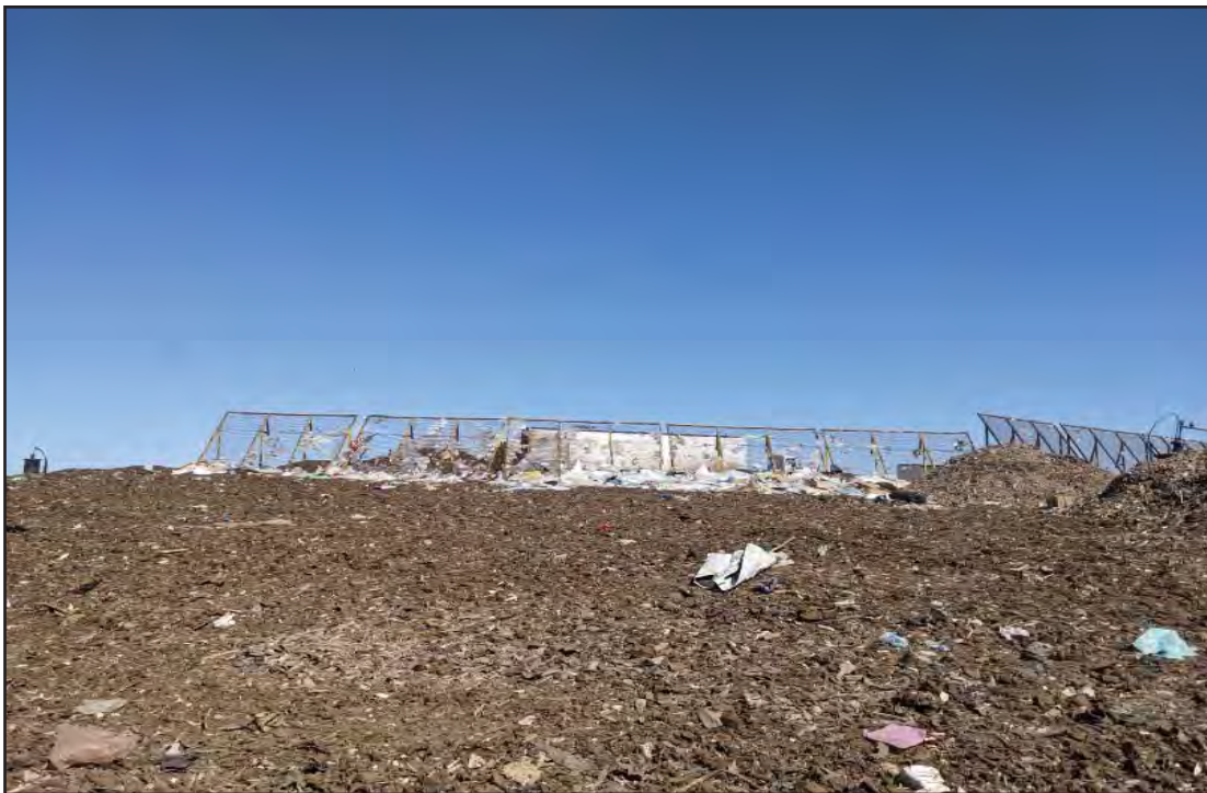
Temp wind/litter screens placed inline with wind