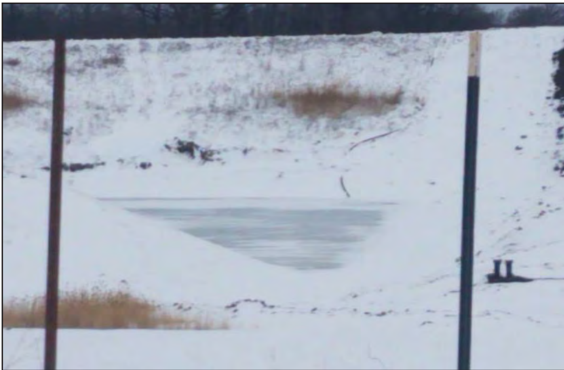
Temp sed basin missing pump, but frozen conditions prevent pump operation