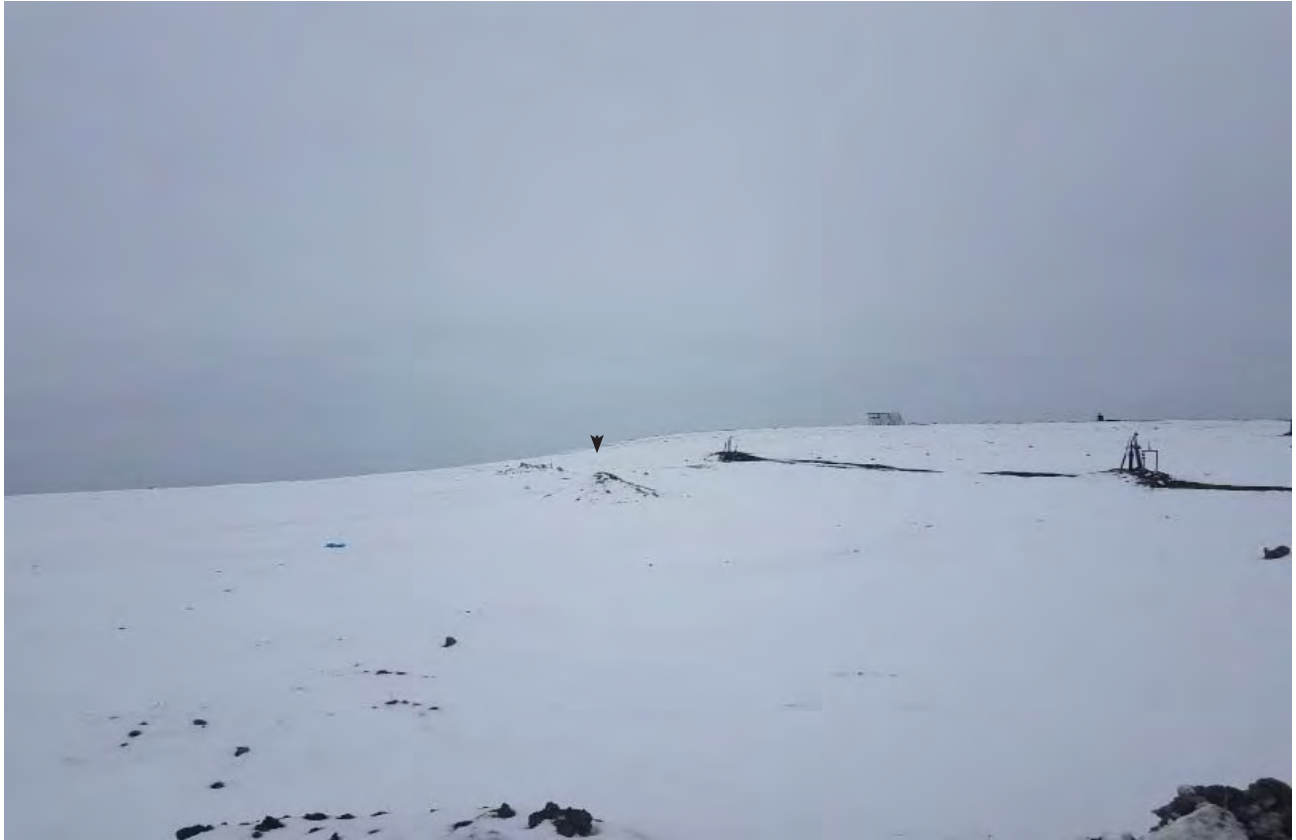
South slope of Phase 7, no disturbed or discolored snow