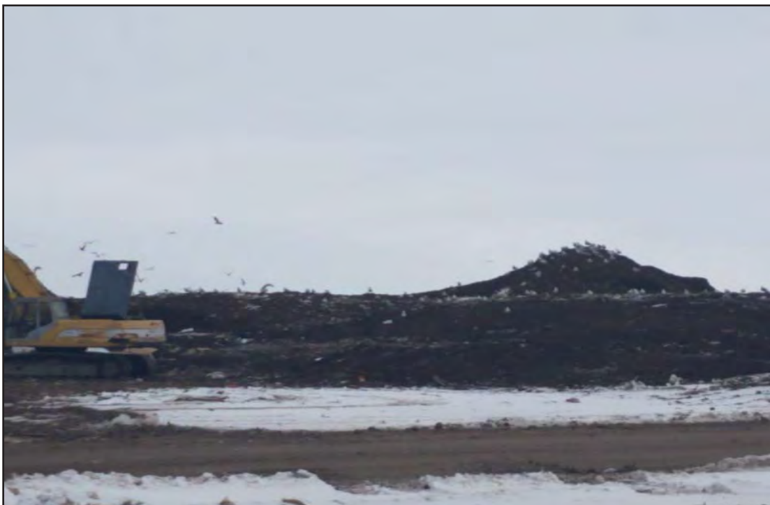
Current lift of waste placement moving slowly about Phase edges and North