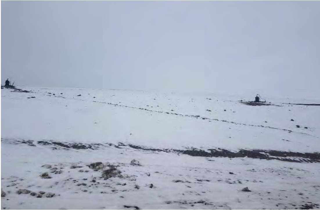
West slope of Phase 7, some snow melt over gas lines, but not flows or discoloration