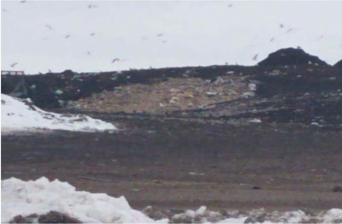
Cover materials stockpiled in active area