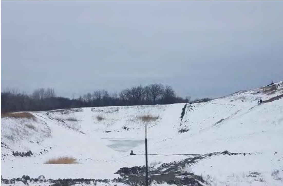
Temp sed basin frozen, side slope clean