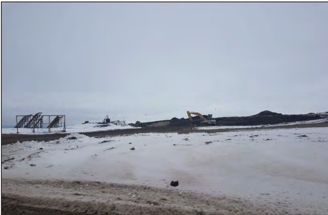
Top of Phase 7 North and South