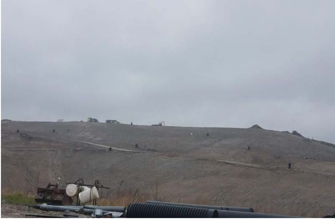
Phase 7 viewed from the West