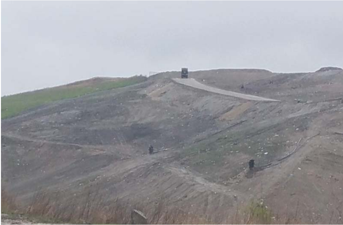
West slopes restored after trenching