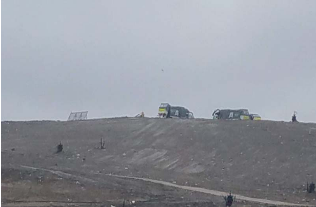
Phase 7 viewed from the West