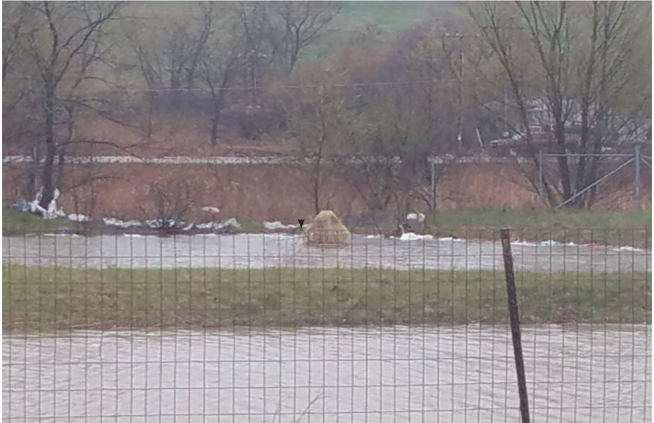
Control structure of Basin 3, litter greatly reduced. Tree growing from control structure