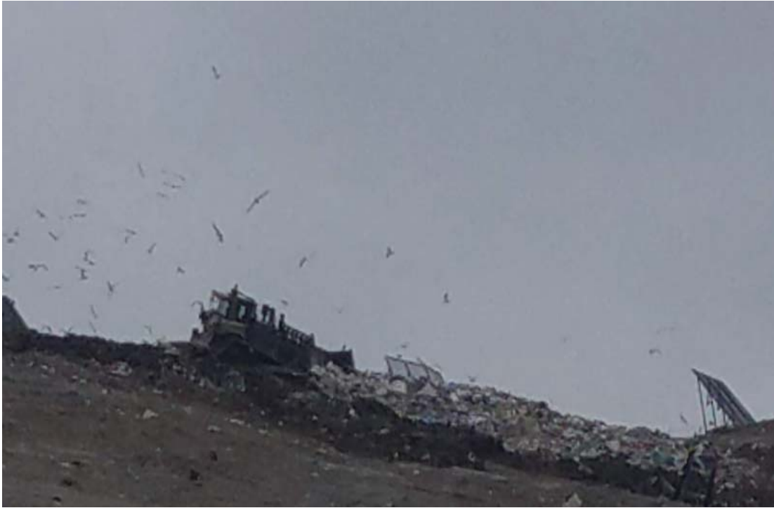
Dozer placing waste for compaction on outboard slope