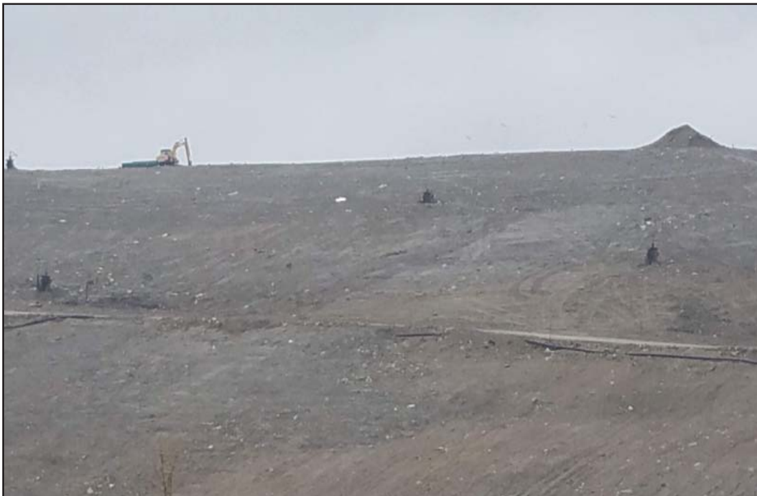
No evidence of seeps on West slope