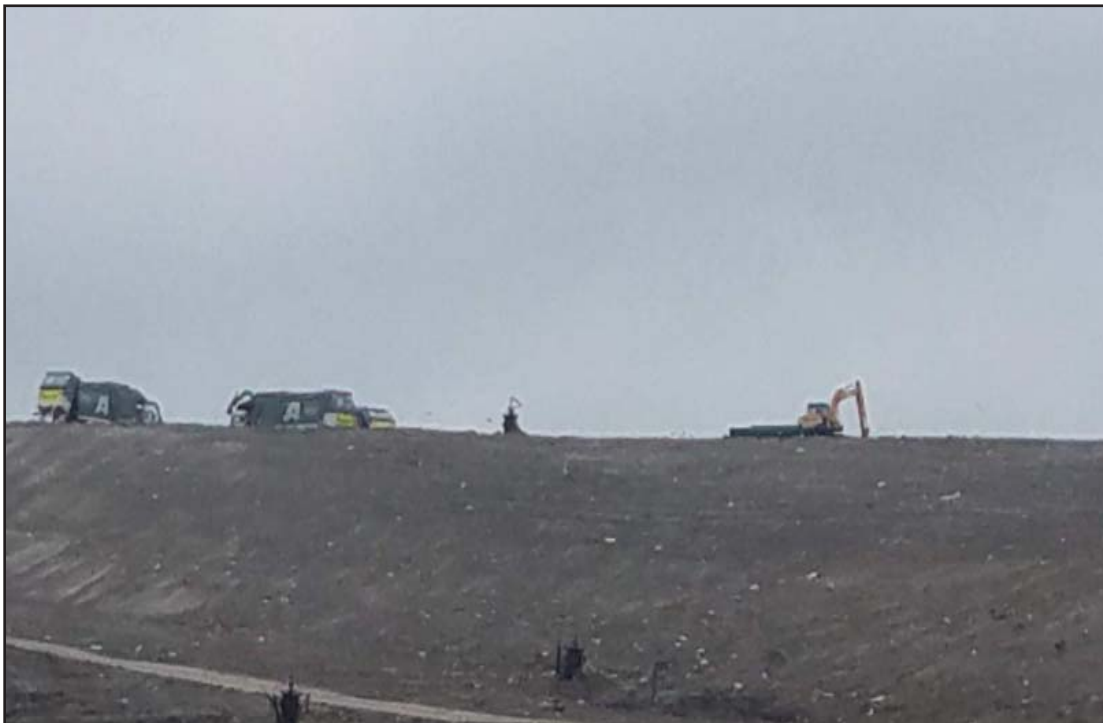
Phase 7 viewed from the West