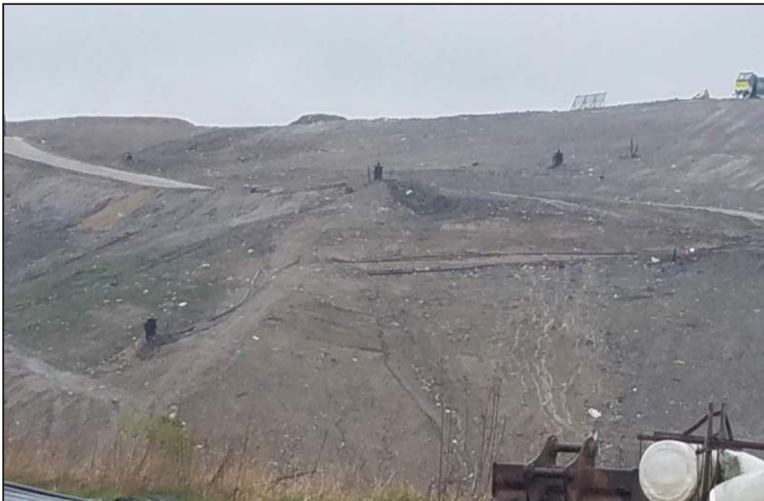
West slopes restored after trenching