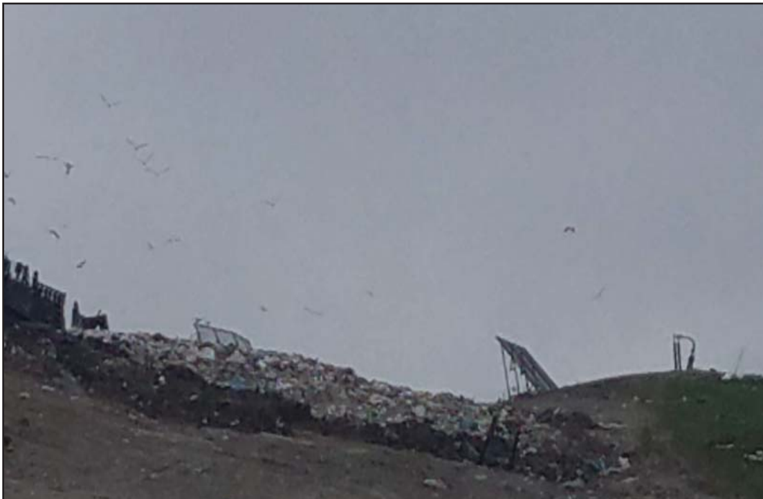
Working face at top of South slope at junction of Phase 6 & 7 South