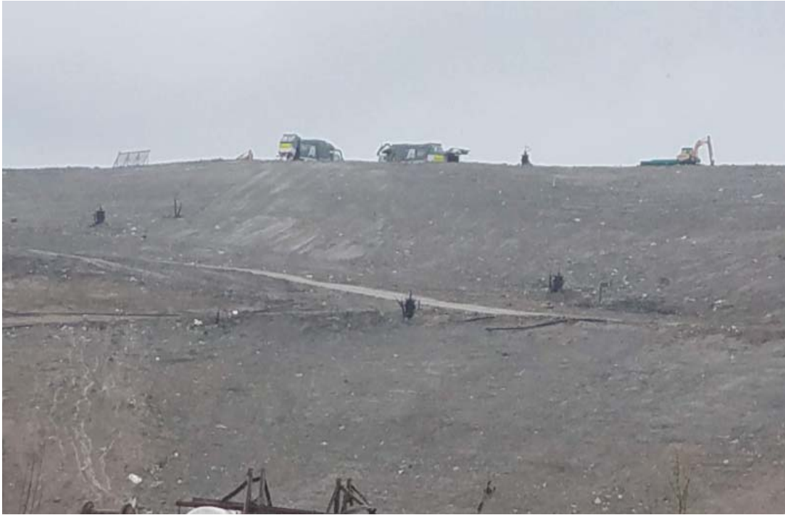
West slopes restored after trenching