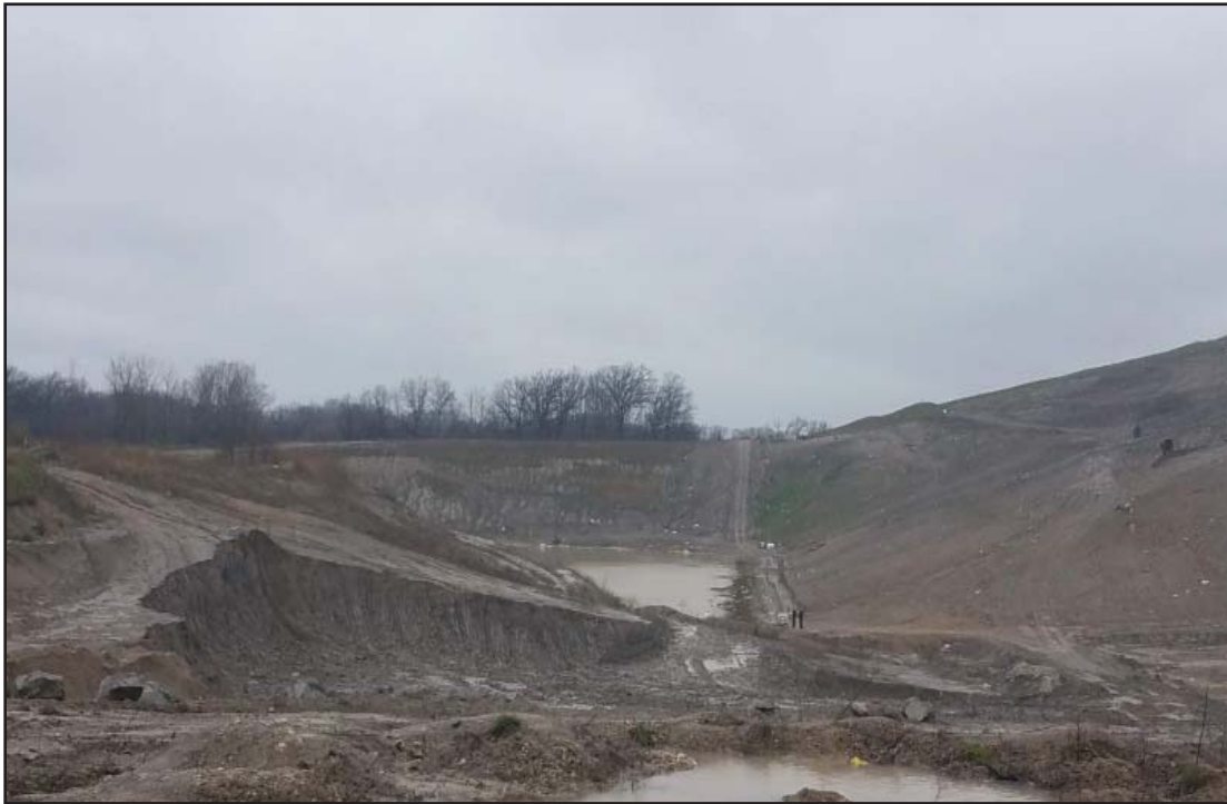
Temp. Sed Pond well pumped