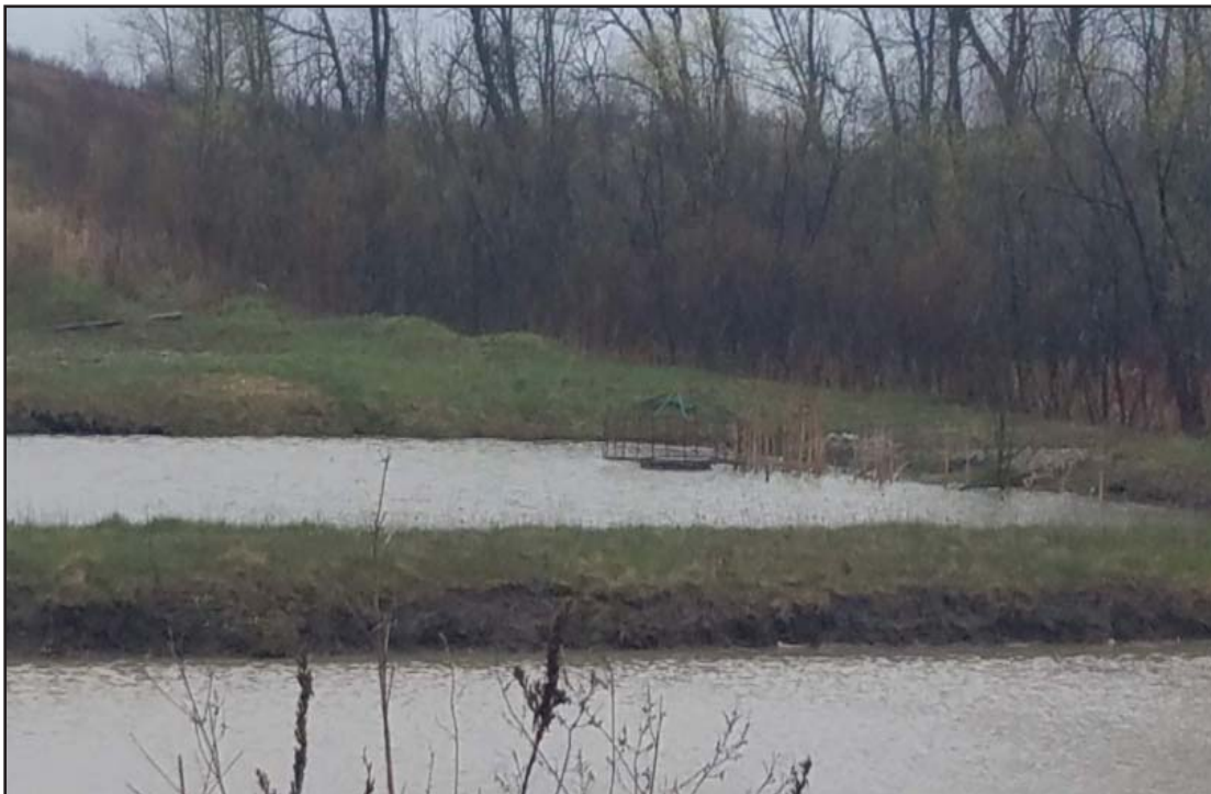
Control Structure of Basin 2