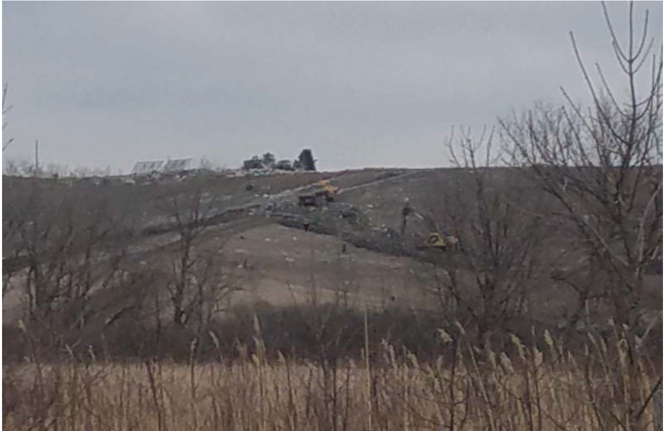
Trenching on Phase 7 slopes for the installation of air and force main lines