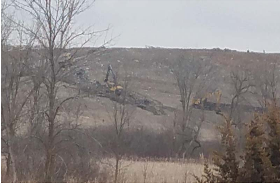
Trenching on Phase 7 slopes for the installation of air and force main lines