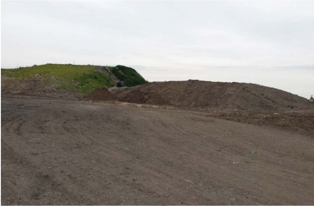
Bio soils, very little change over the last month