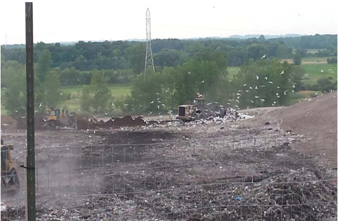
Compactor working in waste at top of slope