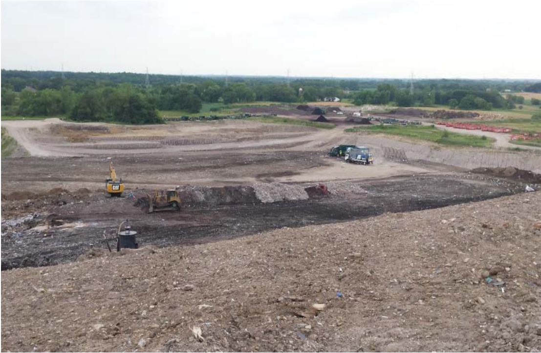
Access and approach to access area