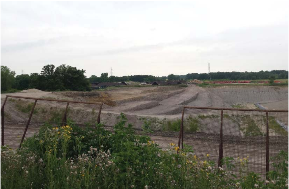
Excavation area for future Phase 8, no back haul or excavation this week