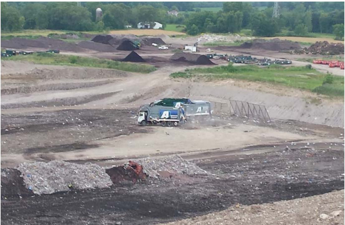
Overview of Active area, trucks in cleanout area in Southwest corner of Phase