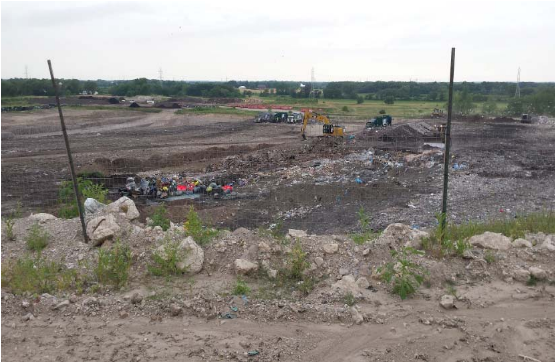
Working face and cover activities