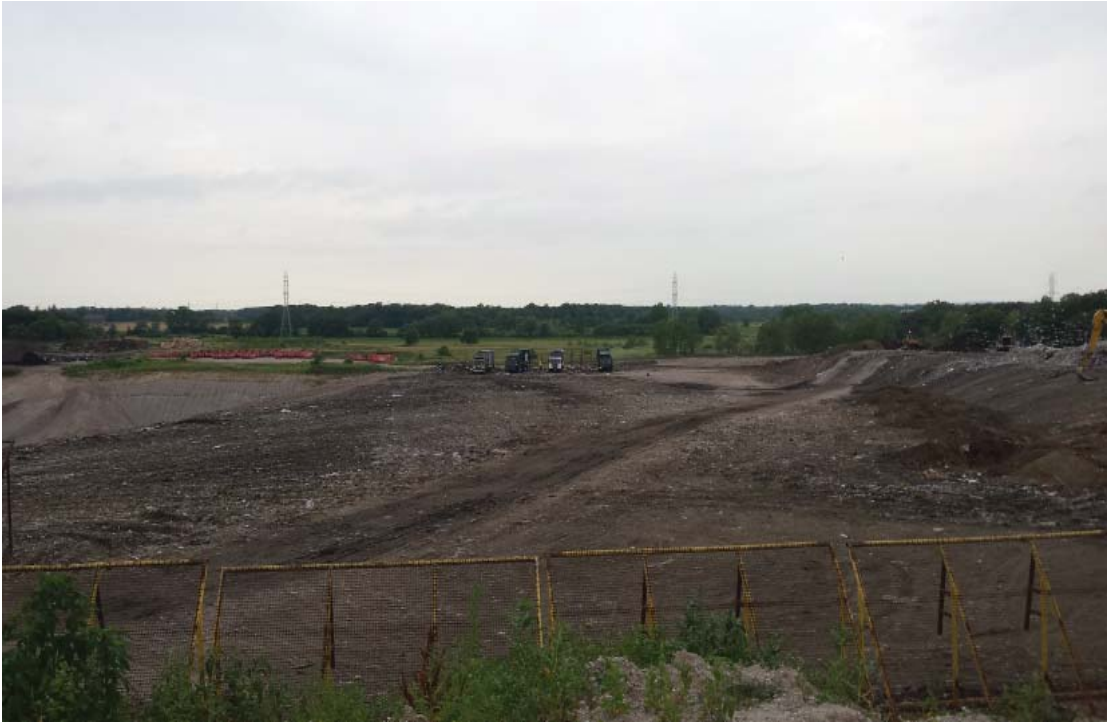
Surface of active area, trucks cleaning out in the far distance of photo