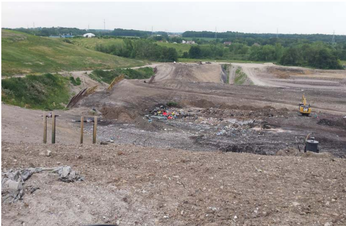
Active area viewed from North. Cover of waste active below.